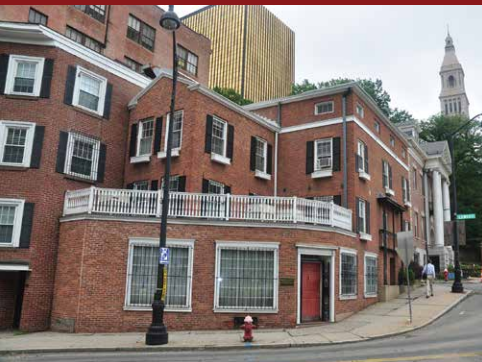
The Law Office of Spinella & Associates is located at historic One Lewis Street, on Bushnell Park in downtown Hartford.